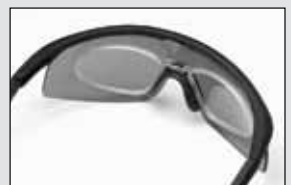
Optional Rx Carrier