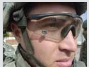
Lt. A's eyesight was saved by the Sawfly System