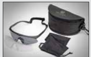
U.S. Military Kit

‡The Deluxe 3 lens kit includes a high-contrast (yellow) specialty lens which is not approved for military use by the US Army. **See Price List for product numbers and descriptions.